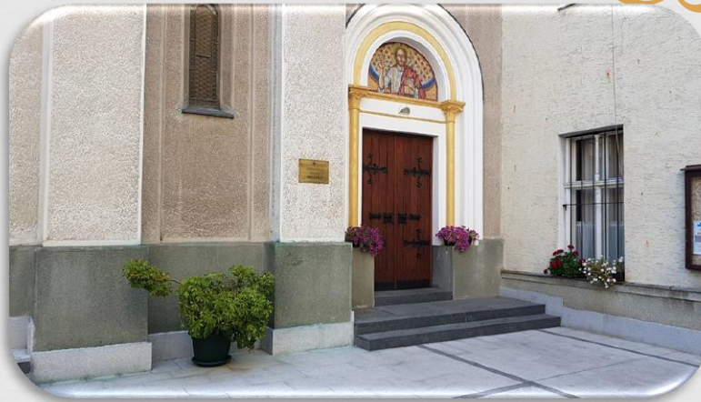
Façade and fence