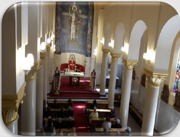
Internal areas inside of the Church