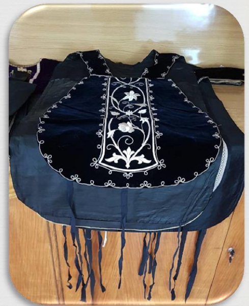
Old robe fundus